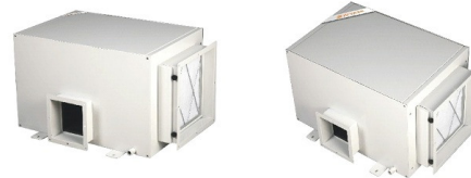
Ceiling Mount Dehumidifier