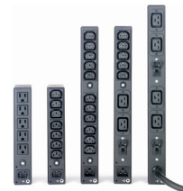
Power Distribution Unit (PDU)