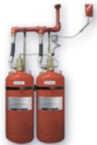
Clean Fire Suppression