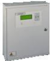
Water Leak Detection