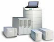
Uninterruptible Power Supply