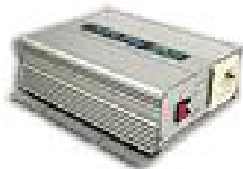
DC/AC Power Supplies.