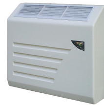
Swimming Pool Dehumidifier