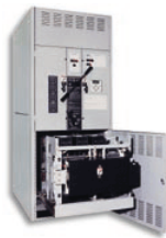
Automatic Transfer Switch